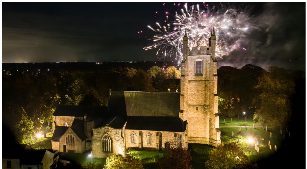
Image of Sedgefield Town Council's 2023 fireworks display

The publication of this Annual Report will coincide with our Annual Town Meeting held on Tuesday 7th May 2024 at 7pm in Sedgefield Parish Hall. This meeting will be an opportunity for the Council to not only present this report but also to answer any questions from the public. This report can be viewed on the Council's website or at the Council Offices.